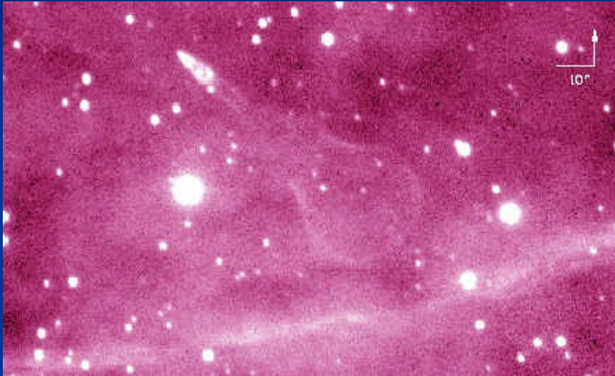
Guitar Nebula: B2224+65